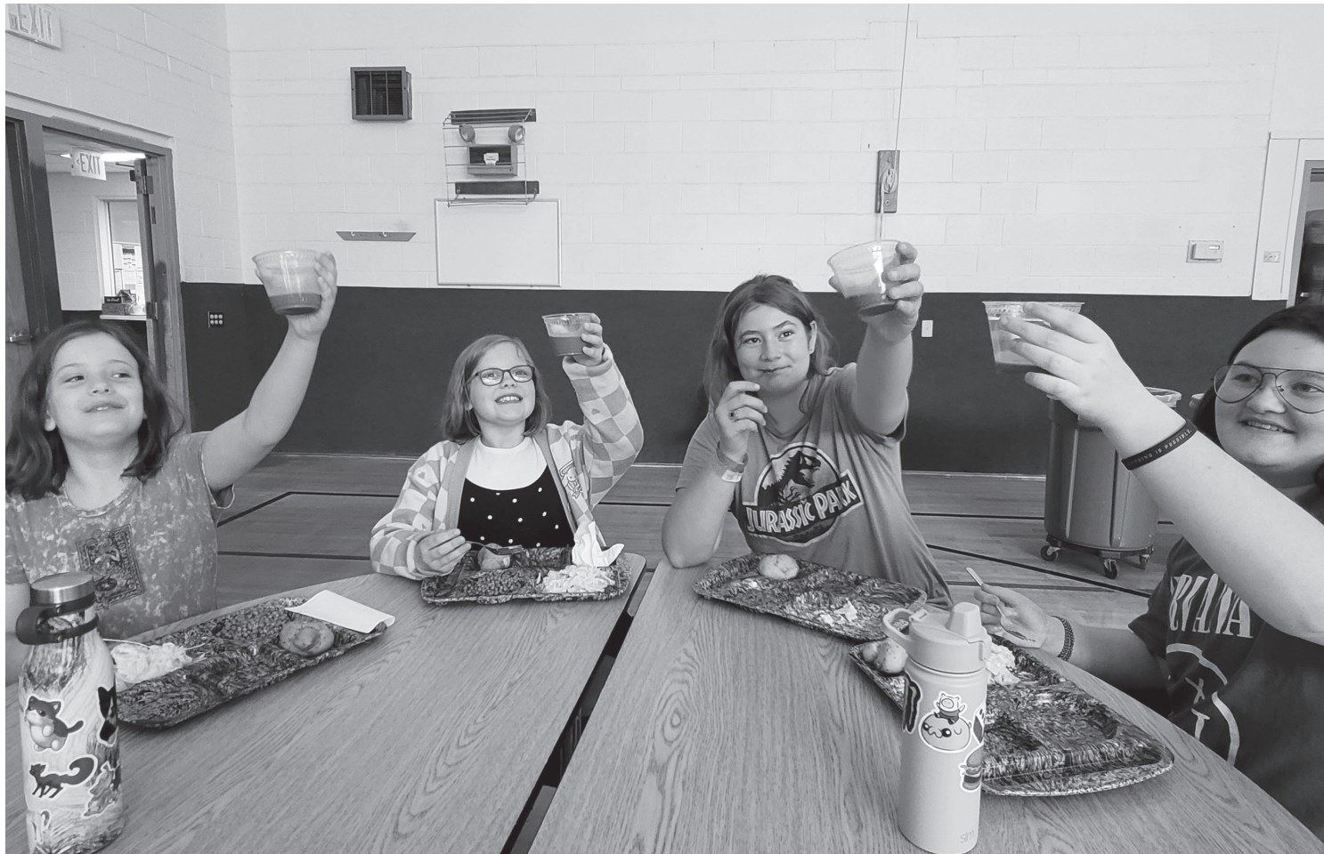
Cheers to a delicious lunch at Grafton Elementary School.