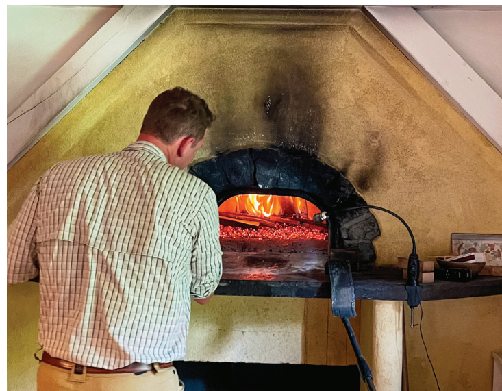
Top to bottom, right to left: Wood-fired pizza gets its final toppings at a pizza social at Understory Farm in Bridport (photo courtesy of New England Food and Farm); Workshop attendees learn about riparian buffers at Boneyard Farm in Cambridge; Members of the Farmer Olympics team from Luna Bleu Farm/Flying Dog Farm celebrate their medal; Joyful connection at a pizza social at Understory Farm in Bridport (photo courtesy of New England Food and Farm); Workshop attendee checks out the oven that will be used to cook bread made from local grains at Brot Bakehouse in Fairfax.