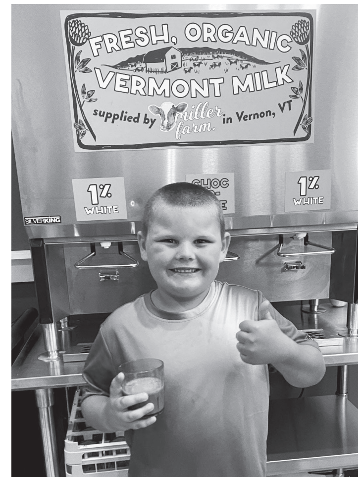
A kid fills up a cup of chocolate milk at Westminster Center School.

Says Pete Miller of Miller Farm, “This model of local small processors working with area schools could be replicated across the nation. It’s so important for each generation to know where food comes from: when people can draw a straight line between a product and a producer, there is built-in a certain amount of accountability and trust.”